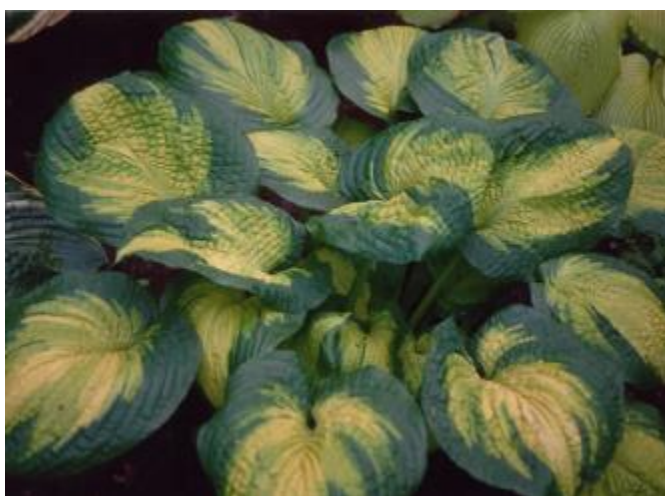
Hosta 'Brother Stefan', 2017 Hosta of the Year