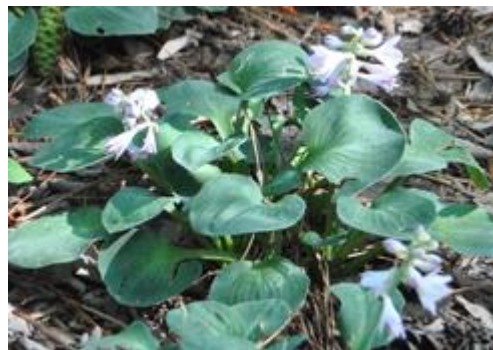
Hosta 'Blue Mouse Ears'

They have all been favorites in recent General and Mini Popularity polls. See Warren Pollock's article on the next page to learn how to participate in this year's popularity poll.