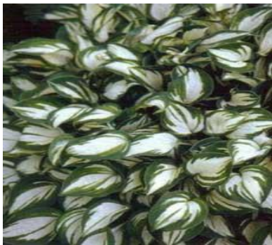
Hosta 'Pandora's Box'