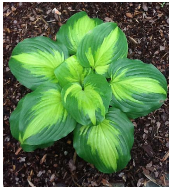
H. 'Cathedral Windows'