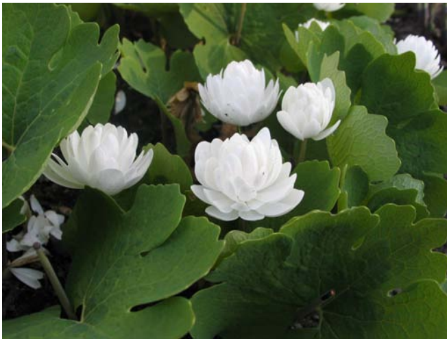
Sanguinaria canadensis 'Multiplex' Double Bloodroot