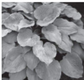
H. 'Sterling Medallion'

MAKE CHECK PAYABLE TO AHS. Mail Order Form and Payment to: