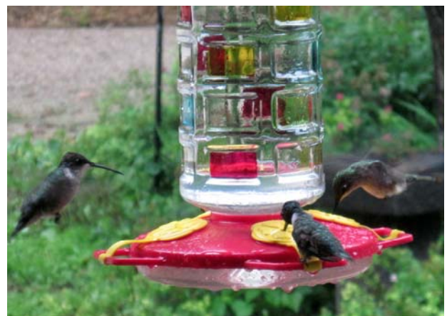
Waiting for clearance to land